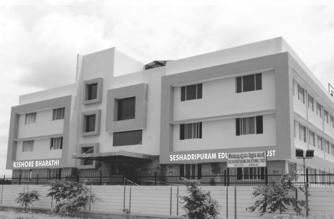
Campus Tour Seshadripuram School, Tumakuru