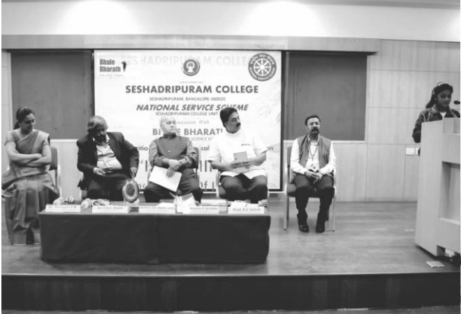
"ಕಾಶ್ಮೀರ ದ ಕ್ರೋ ಆಫ್ ಇಂಡಿಯಾ"- ವಸ್ತುಪ್ರದರ್ಶನ ಉದ್ಘಾಟನೆ