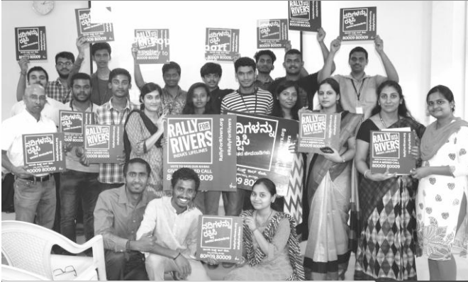
Rally For Rivers