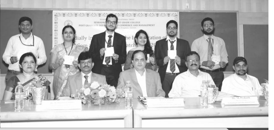
M.Com. & M.Com. (F.A.) Courses Inauguration