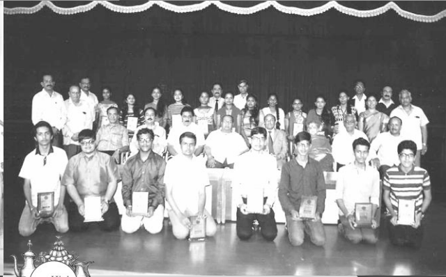
High Tea Celebrations