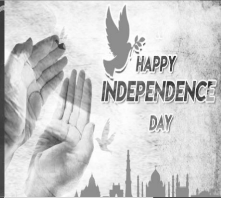
Independence Day Celebrations