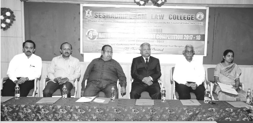
4th National Level Moot Court Competition 2017-18

ಶೇಷಾದ್ರಿಪುರಂ ಶಿಕ್ಷಣ ದತ್ತಿ ಶೇಷಾದ್ರಿಪುರಂ, ಬೆಂಗಳೂರು-560020 www.set.edu.in | info@set.edu