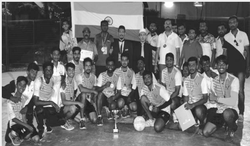
S.F.G.C. students at Malaysian Independent Asian Club Throwball Championship, Malaysian Throwball Club, Malaysia